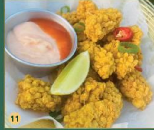
11 Salt and Pepper Squid 14.90 Crispy fried squid with salt and pepper.