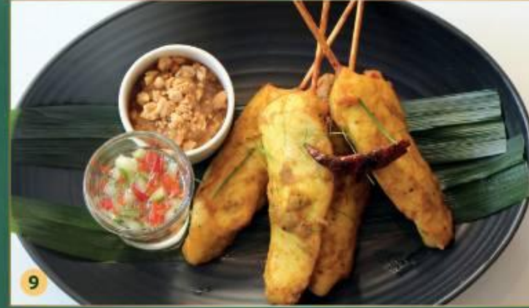
9 Chicken Satay Skewers (4) 13.90 Chicken breast skewers served with satay sauce.