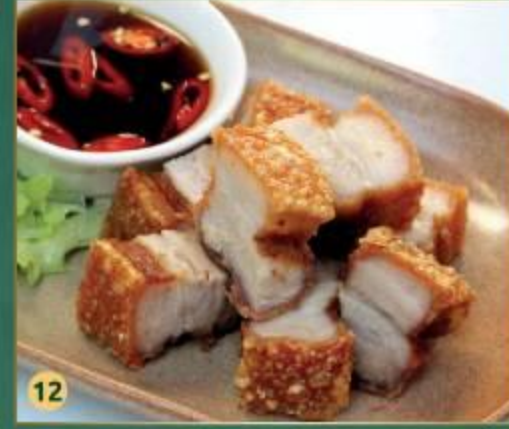
12 Thai Style Crispy Pork GF 15.90 Thai style pork crackling served with vinaigrette syrup.