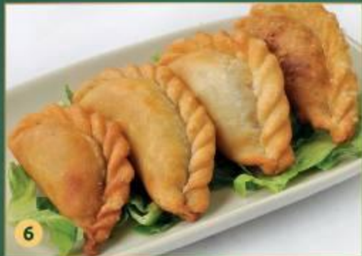
6 Chicken Curry Puffs (4) 13.90 Deep fried puff pastry with curry chicken and vegetable filling.