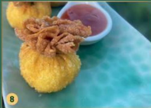
8 Money Bags (4) 13.90 Chicken and prawn mince wrapped in wonton skin.