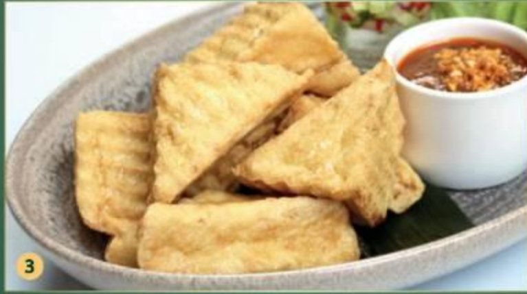
3 Golden Tofu (1 cube) VEG 11.90 Golden and crisp deep-fried tofu served with satay sauce.