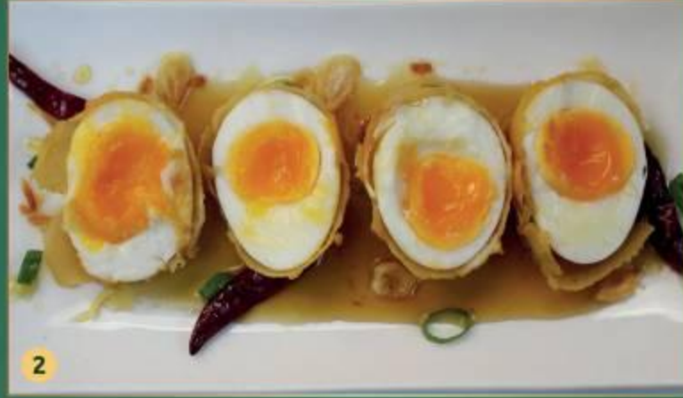
2 Crispy Eggs (2) 11.90 Crispy deep-fried eggs with tamarind sauce. Sweet and sour in flavour.