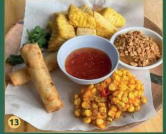
13 Veggie Platter for Two VEG 21.90 Combination of vegetarian entrees: Golden Tofu, Spring Rolls and Thai Corn Cakes.