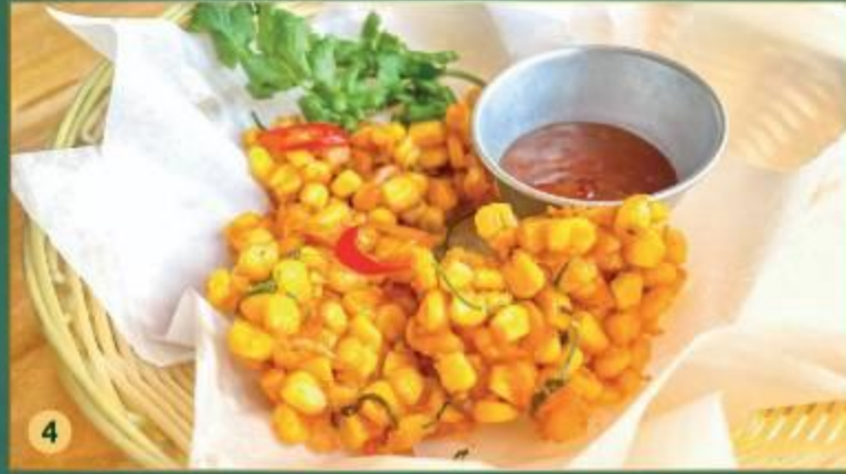
4 Thai Corn Cakes (4) VEG 12.90 Fried light battered corn with red curry paste and kaffir lime leaf.