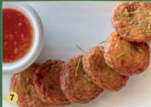
7 Thai Fish Cakes (6) 13.90 Deep fried fish paste mixed with red curry paste and herbs.