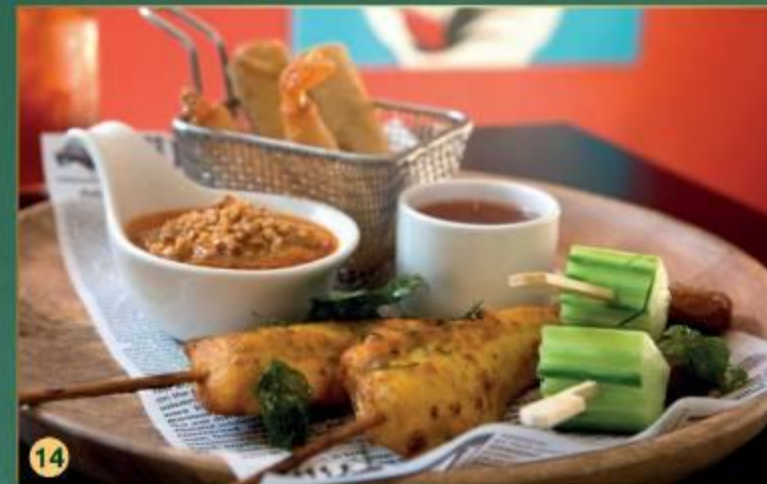
14 ViPa's Platter for Two 23.90 Combination of our popular entrees: Spring Rolls, Chicken Satay, Fish Cakes and Prawn Wraps.