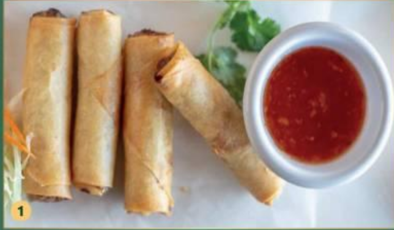
1 Spring Rolls (4) VEG 11.90 Deep fried mixed vegetables and glass noodles rolled in a pastry sheet.