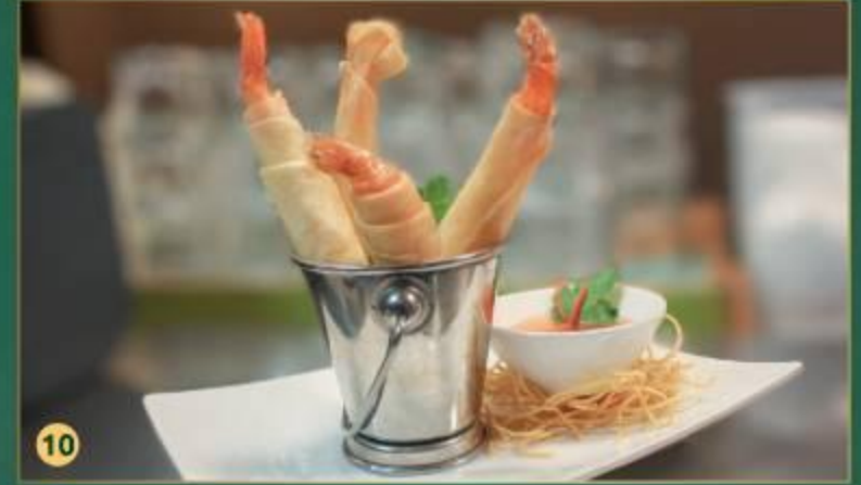
10 Prawn Wraps (6) 13.90 Deep fried whole prawns wrapped in pastry sheets.